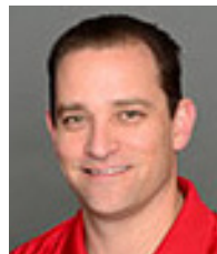
Senior Vice President, Content and Communications, Arizona Diamondbacks